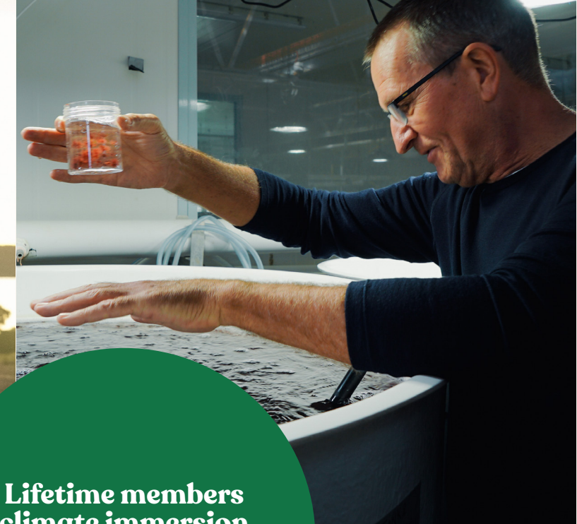
Lifetime members climate immersion trip to Spring Bay Mill, March 2022